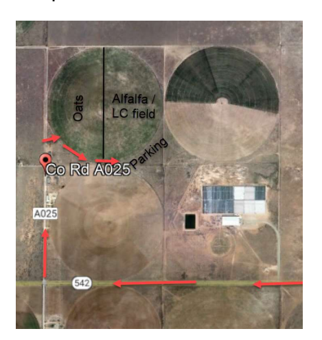
There will be a port-a-potty on-site.

Follow 542 for 2 miles, past the greenhouses, to County Road A025 / La Trencaieriea Road. Turn right and proceed 0.5 miles through the gate. Turn right to follow the southern border of the pivot, to the alfalfa where the course is set. MAX SPEED 15 mph on dirt roads!